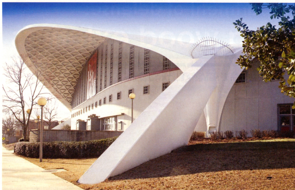
The water-borne PVDF coatings are reported to provide a high degree of stain and dirt resistance and barrier properties that prevent “bleed-through” of asphalt and plasticizer components in roof substrates, contributing to long-term retention of solar-reflectivity levels.

Petersheim says the lower-VOC product will facilitate applications in the important Southern California market, where the water-borne PVDF-based coatings could be used as a thin-film reflective topcoat over an acrylic basecoat in programs to restore low-slope roofs with solar-reflective coatings systems. The PVDF-based topcoat provides superior dirt, stain, and mildew resistance, result-